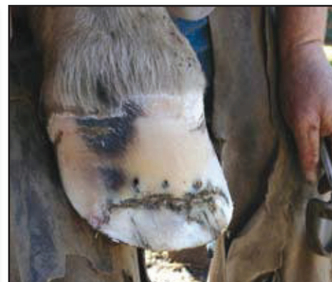
Above left: The hoof prior to treatment - a large portion of the hoof wall from the toe to the outside quarter was gone.