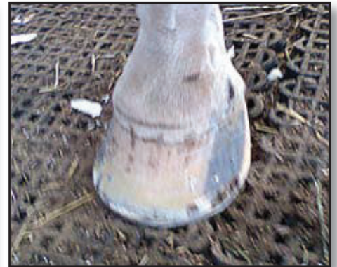
Top Right: It took 12 months but the hoof is now almost back to normal.