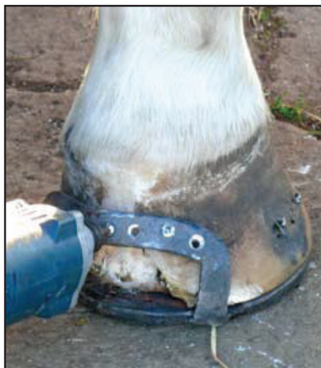
Left: Applying the banded shoe for lateral support of the hoof wall.

however my farrier was not prepared to strip the whole of the remaining wall back, only to fill it up again with the product, on such a heavy horse that requires quite extensive outside support, particularly as the horse would be going into a wet Tasmanian winter. Although not averse to such products, my farrier believed it was not the right form of treatment for this horse, at this time.