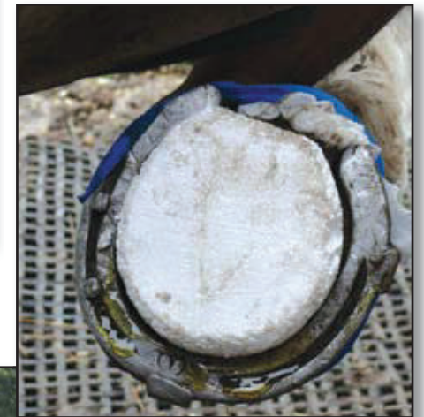
Above: The hoof with the polystyrene sole packing - the Venice Turpentine can be seen dribbling out from the edges.